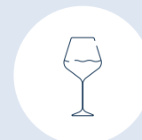
Wine, beer, and other alcoholic drinks