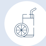
Cold drinks, juice