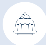
Jelly and custard